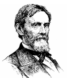
Jefferson Davis Davis Bi-centennial 1808 - 2008

-anonymous Confederate soldier waiting to make Pickett's Charge upon seeing a rabbit run after being spooked