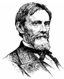
Jefferson Davis Davis Bi-centennial 1808 - 2008